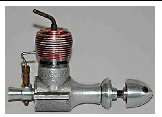
Fig. 3. Polish self-ignition engine "Jaskółka" with a capacity of 2.5 cm<sup>3</sup> [26]

Over the years, the modeling engines have been improved more and more. New, better and better flushing systems began to be used in two-stroke engines. A good example is the 1.8cc "Elfin 1.8" engine. It reached the power of 0.11 HP (about 0.8 kW) and the volumetric power ratio of 61 HP/dm<sup>3</sup> (45 kW/dm<sup>3</sup>), which was much more than in the analogous spark ignition engines of that time. Such engines were also built in Poland. An example can be the famous "Jaskółka" Fig. 3 [14].