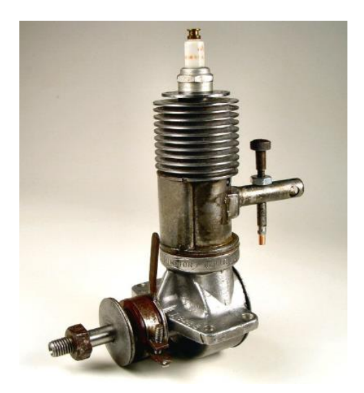
Fig. 2. Engine Brown "Junior" [25]

in 1934 in the USA; It was called Brown "Junior", Fig. 2. It was a two-stroke, single-cylinder, spark-ignition engine, also called gasoline engine in modeling terminology because of the fuel it burns. It had a displacement of 9.72 cm<sup>3</sup>. It reached the power of 0.25 HP (approx. 0.2 kW) and the maximum speed of 6000 rpm. Currently, engines of this size can have nearly 10 times the power and 2-3 times the maximum speed. Nevertheless, at that time the Brown "Junior" engine was a breakthrough design and for those times – very modern.