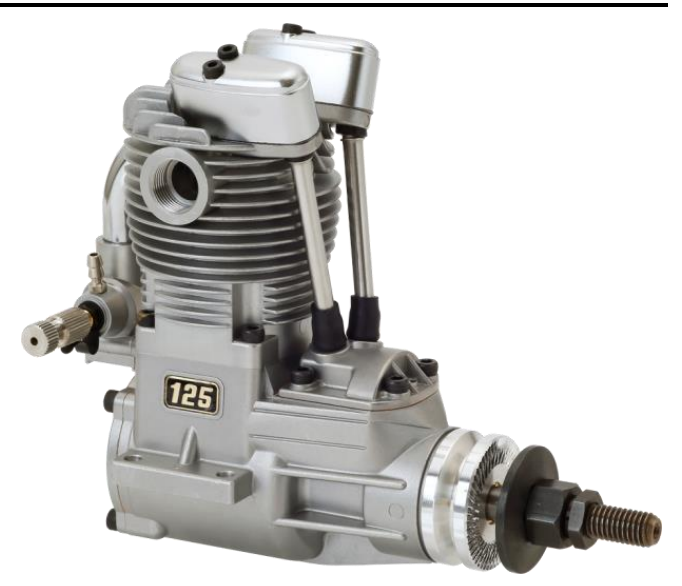
Fig. 8. The Saito FA-125 A four-stroke glow-ignition engine [36]

As can be seen from the comparison in Table 1 and 2, the power of two-stroke engines is much greater than the power of four-stroke engines. Two-stroke engines with small and medium displacements also have significantly higher maximum speeds. In four-stroke engines, however, they do not change significantly with increasing displacement, while in two-stroke engines they decrease significantly. Thus, large four-stroke engines (from about 15 ccm) often have higher RPMs than similarly sized two-stroke engines.