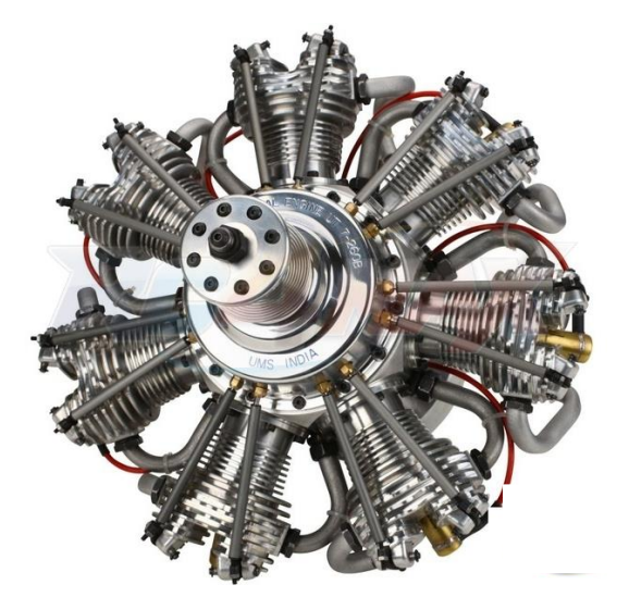
Fig. 11. 7-cylinder Evolution Radial 260cc engine [37]

In-line engines (Fig. 12) are rarely used in modeling; there are very few designs of such engines. Two-stroke inline engines may be an alternative to push-pull cylinder engines in airplanes which require a narrow fuselage for some reason. An example can be models of real airplanes, which in fact also had an in-line engine [21]. The fourstroke in-line engines are more exclusive. By using such engines in models of real aeroplanes, you also get pure sound, more like the original engine used in a real, original airplane.