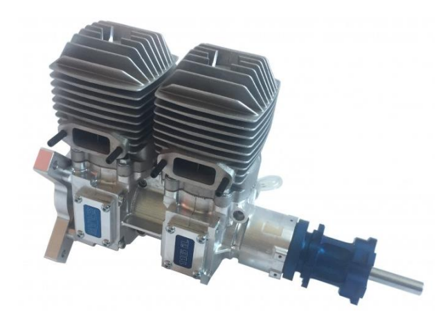
Fig. 12. MVVS 116 iL two-cylinder two-stroke in-line engine [31]