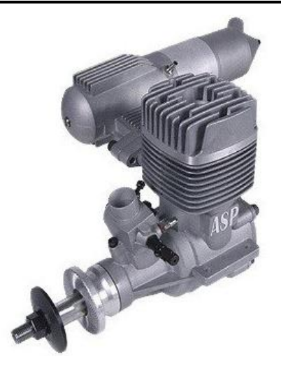
Fig. 7. ASP 180 AR two-stroke glow ignition engine [29]

The only real advantage of 4-stroke engines is their clear sound when operating. It is especially appreciated by modellers. In models of real aircrafts, it allows not only to match the original appearance, but also in terms of the sounds that the plane makes during the flight. Four-stroke engines are considered more elegant and exclusive than ordinary two-stroke engines [11].