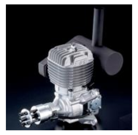
Fig. 5. O.S.Gasoline spark ignition engine MAX GT60 [33]

often advertise the sounds of their engines. Four-stroke radial engines and sometimes also four-stroke in-line engines are considered extremely exclusive. They are valued primarily for their aesthetic qualities. They can also be used in mock-ups of airplanes that actually had radial engines. Thanks to this, instead of inserting a mock-up of a radial engine into the engine cover, you can place a real engine there, which powers the model during flight [21].