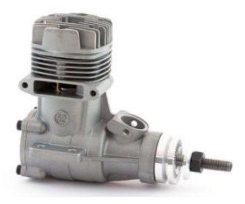
Fig. 4. Modern ASP S52A glow engine [29]

In the 1950s, further development of model drives showed the superiority of glow engines in terms of the power achieved. However, in Europe, self-ignition engines were already very common. They also burned less fuel. Glow engines slowly began to appear on the European market in the second half of the 1950s, but they were fully ousted only several dozen years later, Fig. 4.