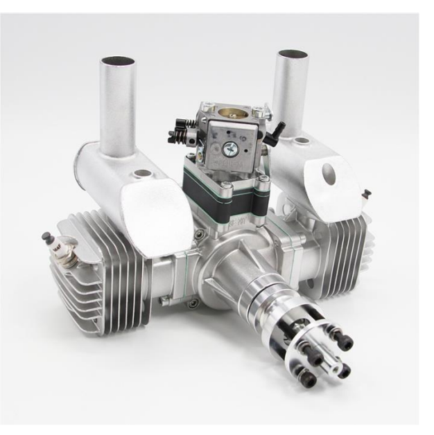
Fig. 10. Two-stroke gasoline boxer engine RCGF 70cc T [34]

then also four stroke. Their displacement volumes do not exceed 60 cm<sup>3</sup>, i.e. up to 30 cm<sup>3</sup> per cylinder. However, they are quite rare exclusive products, in which the aesthetic values and the sound they produce outweigh the practical ones; similar to the single cylinder four-stroke engines. Pull-push cylinder arrangement engines are usually built for high horsepower, and therefore have a two-stroke cycle.