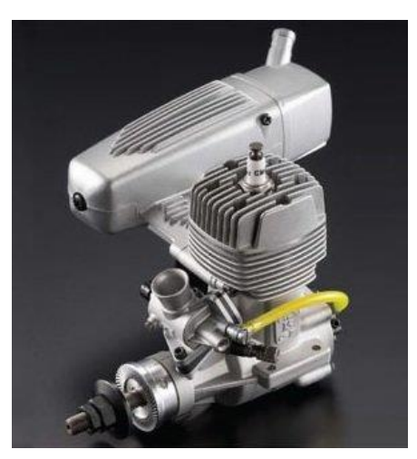
Fig. 9. Spark ignition engine O.S. MAX GT15 [29]

a composition of 70% methanol and 30% nitromethane has a calorific value of about 25% greater than that of pure methanol [16]. You can buy it only in stores and modeling wholesalers, which makes it much more expensive than gasoline. This is the main reason why gasoline engines are used, not just glow ones.